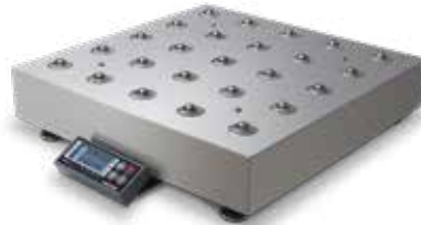
Model BP-1818 with ball top shroud