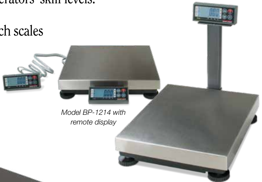
Model BP-1214 with remote display